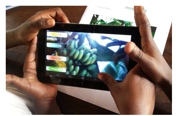
Figure 1: The main screen for the AR learning tool prototype

To realize this, we used Eclipse Integrated Development Environment, Java for Android, C++ and Qualcomm Vuforia Software Development Kit. We deployed our learning tool on a tablet computer -a mobile device with a back-facing camera running the Android operating system. Figure 1 shows children interacting with the tool to get information about bananas.